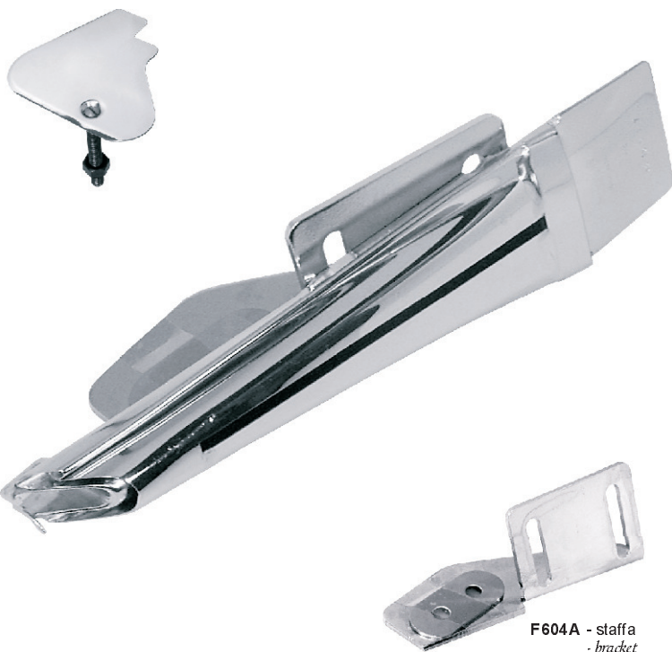
F604A - staffa - bracket

Per macchine piane For flat bed machines