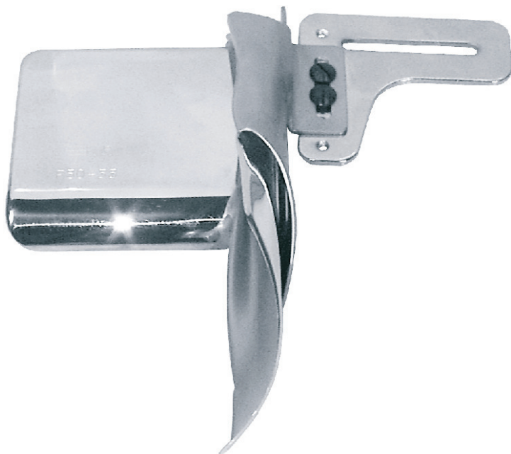
DOUBLE BINDER FOR SHORT STRIPS

Per macchine piane For flat bed machines